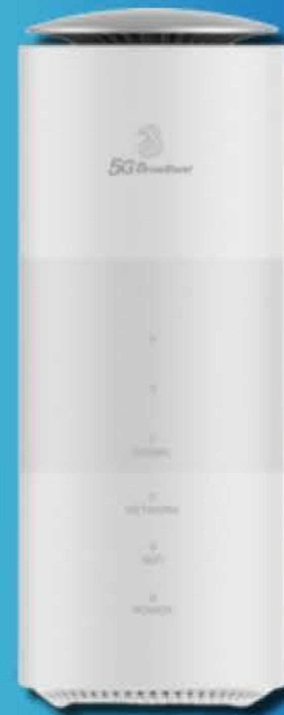
3HK 5G CPE 5